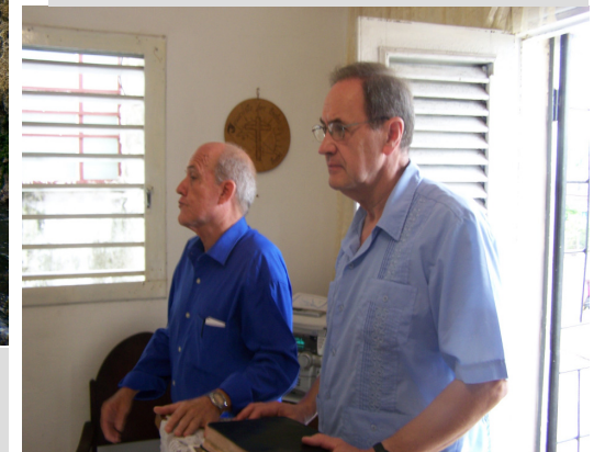
Blythe teaching Preachers of Cuba who are now students in the Bible Institute